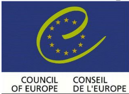
Council of Europe